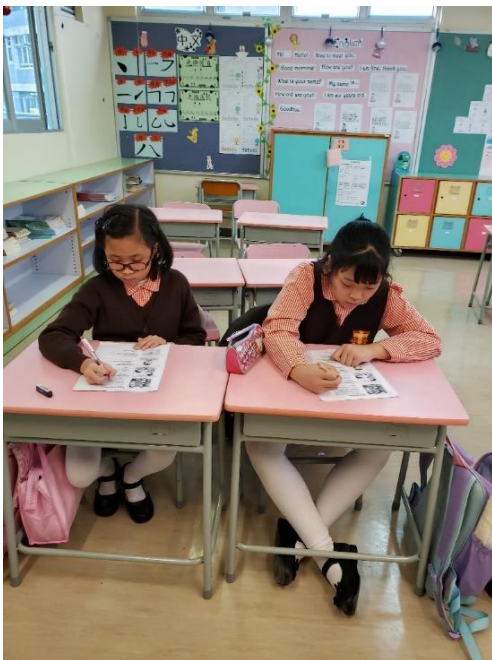
Doing comprehension exercises is not difficult.