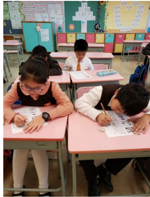
Let's work hard on our writing.