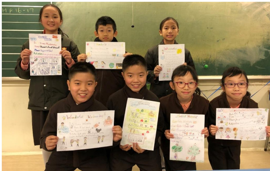
Do you like our Wonderful Wednesday posters?