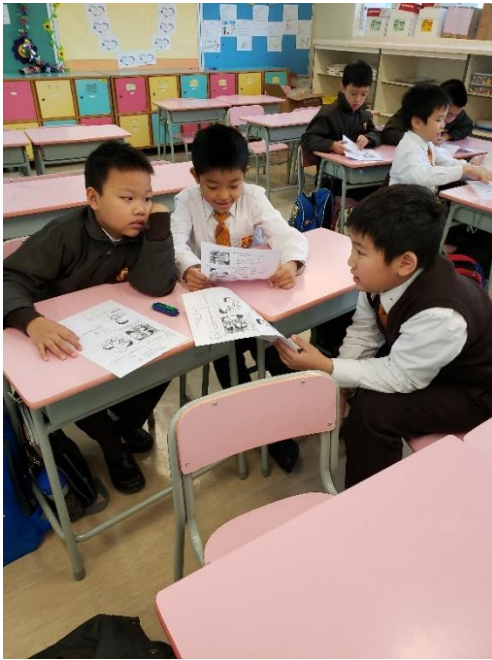
Group discussion helps us brainstorm ideas.

This school year, the teacher introduces the features of different text types. We aim at enriching students' understanding of each text type as well as introducing the reading strategies such as 'Predicting', 'Inferring' and 'Summarising'. The follow-up exercises also reinforce students' learning of the reading skills. On the other hand, students have some practices on writing by using a story planner to brainstorm ideas. It helps enhancing student's writing skill.