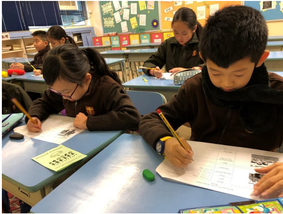
We are making our own stories.

Our Enhancement class aims to equip students with reading and writing skills. Students learn different texts with different features by using various reading strategies. Besides, students finish different writing tasks in order to expose their ideas and stimulate their creativity. Through group discussion, organizing ideas by graphic organizer and peer checking, students develop their writing skill and raise their confidence in writing.