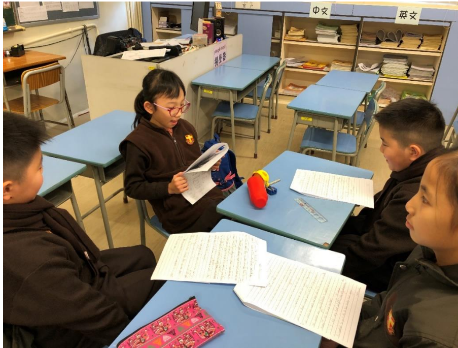
We like sharing our ideas.